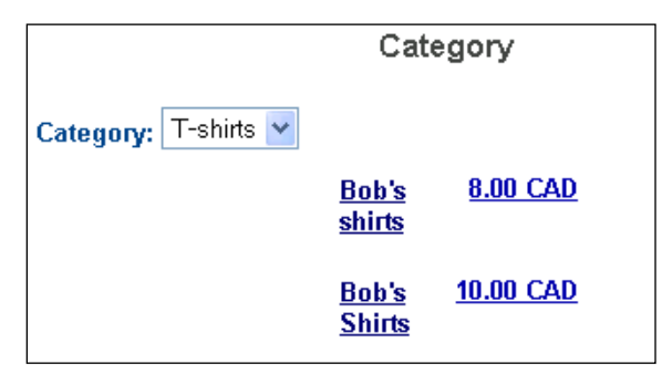
Sample page (before customization)

The product page lists all of the items that are on sale in your online store. There are two main components to the default Beanstream product page. On the left hand side of the screen there is a dropdown menu listing all of the different categories of products that you sell. This allows customers to easily browse only the specific products they are interested in. The main body of the page will display a list of your products including any descriptions or images you have uploaded to your inventory.